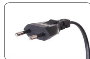
Europlug (C plug)