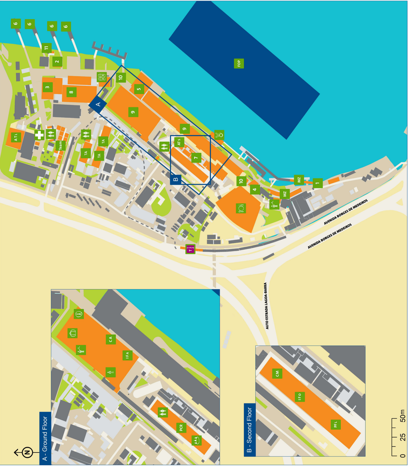
A - Ground Floor